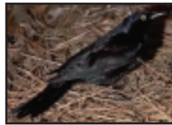
BREWER'S BLACKBIRD ( Euphagus cyanocephalus ) SMALL bird