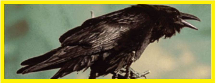
RAVEN ( Corvus corax )