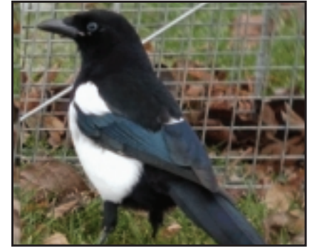
MAGPIE ( Pica hudsonia )