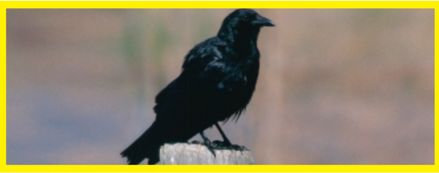
CROW ( Corvus brachyrhynchos )

Note: In 2004, only Blue Jays, Crows and Ravens are to be submitted for testing in Ontario.