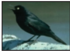
RUSTY BLACKBIRD ( Euphagus carolinus ) SMALL bird