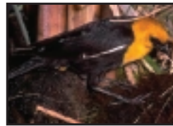
YELLOW-HEADED BLACKBIRD ( Xanthocephalus xanthocephalus ) SMALL bird