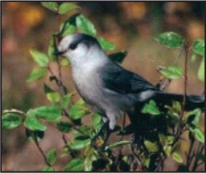
GRAY JAY ( Perisoreus canadensis )