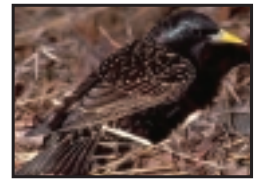
EUROPEAN STARLING ( Sturnus vulgaris ) SMALL bird