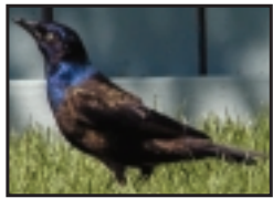
COMMON GRACKLE ( Quiscalus quiscula ) MEDIUM sized bird