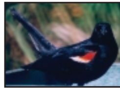
RED-WINGED BLACKBIRD ( Agelaius phoeniceus ) SMALL bird