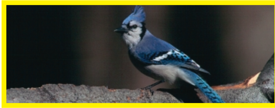
BLUE JAY ( Cyanocitta cristata )