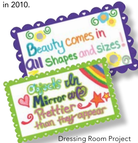
Dressing Room Project mirror decals

The TBDHU used two innovative initiatives to reach students with health messages. The Dressing Room Project, in partnership with St. Joseph's Care Group, involved grades 7 & 8 girls creating positive body-image messages and artwork which was posted on dressing room and washroom mirrors community wide. This fresh approach to helping girls develop a healthy body image drew the attention of a local funding group, resulting in the project receiving unsolicited funds to expand the project. The Eat Smart! Get Caught! campaign rewarded prizes to teens who were "caught" by their peers eating healthy foods in the high school cafeteria. Based on the positive response to both of these creative projects, they will continue in 2010.