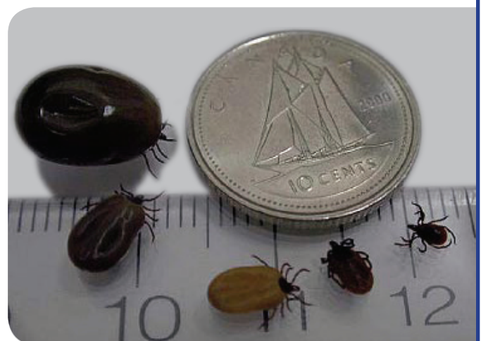
Blacklegged tick in various stages of feeding compared to the size of a dime.

Visit TBDHU.COM for more information about preventing bites, removing and submitting ticks. Call 625-5900 or your nearest Health Unit office (Marathon, Terrace Bay or Geraldton) to get a tick removal kit.