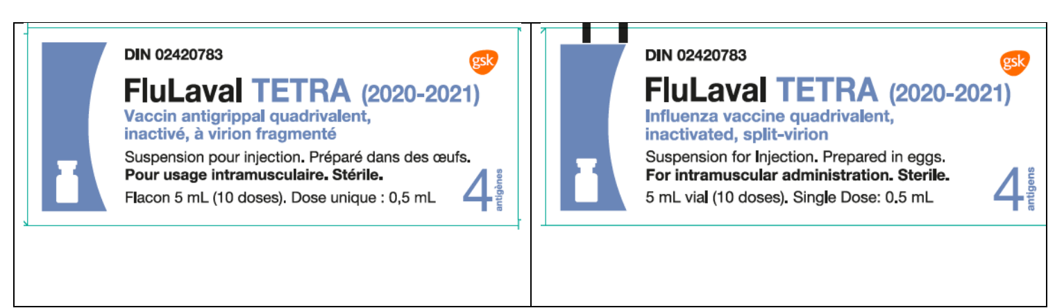
Figure 3 FluLaval Tetra MDV Canadian Carton: Front and Back Panels

Images of FluLaval Tetra MDV Canadian and Influsplit Tetra PFS German cartons are provided below.