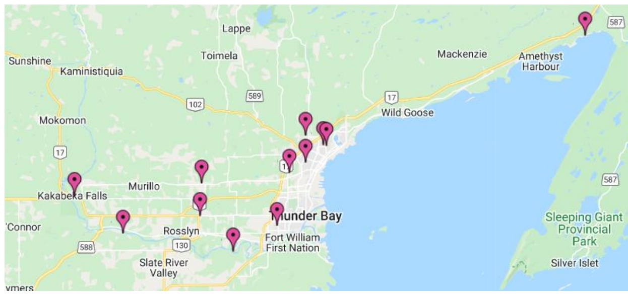
Fig. 1 Location of CDC adult mosquito light traps in the city of Thunder Bay and surrounding area, 2022.

Twelve CDC adult mosquito light traps were operated for one night per week for nine weeks in the city of Thunder Bay and the surrounding area from 27 June to 23 August during 2022 for a total of 105 trap-nights because three traps malfunctioned during the summer. The 12 traps were in the same fixed, secure locations as 2021. Seven light traps were located within the city of Thunder Bay and five in the surrounding area (Fig. 1).