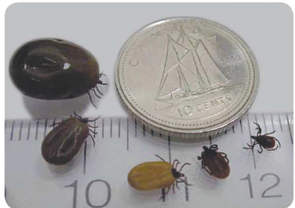
Blacklegged tick in various stages of feeding compared to the size of a dime.